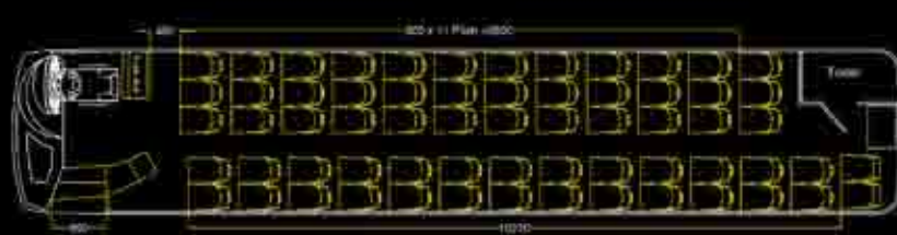
LAYOUT OF MCV S140R | 64 RECLINING PASSENGER SEATS + DRIVER