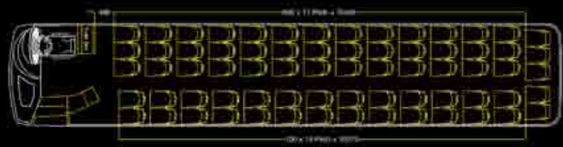
LAYOUT OF MCV S140R | 70 RECLINING PASSENGER SEATS + DRIVER